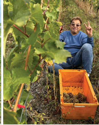
Traversing the steep slopes along the Middle Rhine